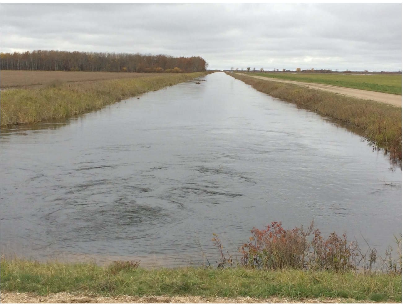
Lat1 SD95 at Roseau County Road 103 – looking west The 'New' 95 will be located on the south (left in this photo) side of the existing ditch